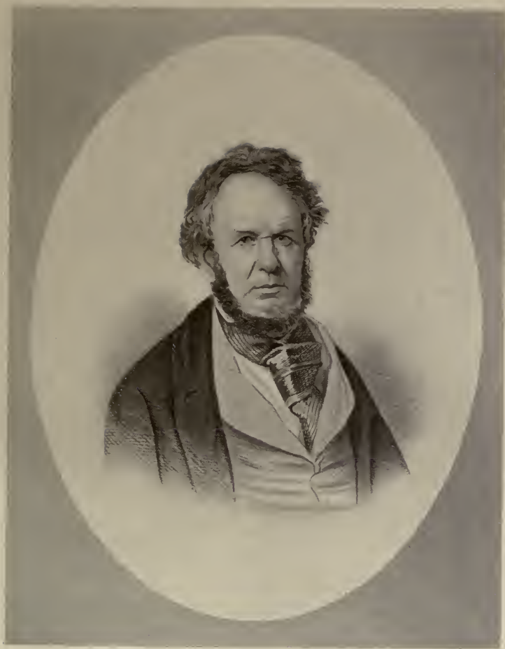
Henry R. Schoolcraft